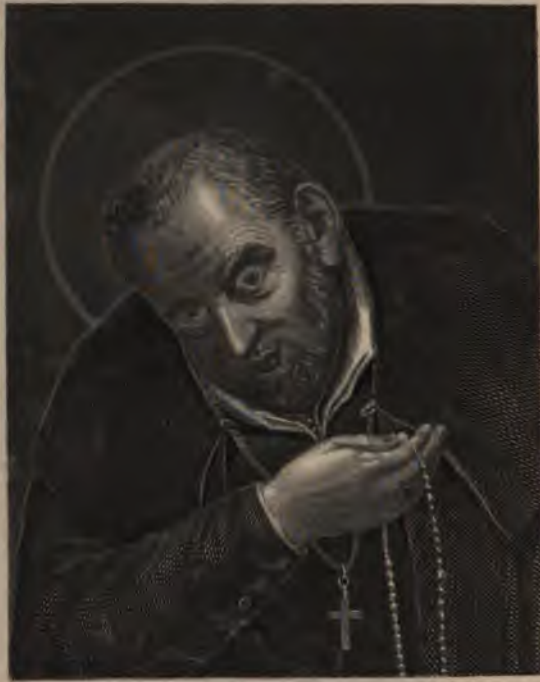
ST. ALPHONSUS MARIA DE LIGUORI BISHOP OF ST. AGATHA, AND FOUNDER OF THE CONGREGATION OF THE MOST HOLY REDEEMER